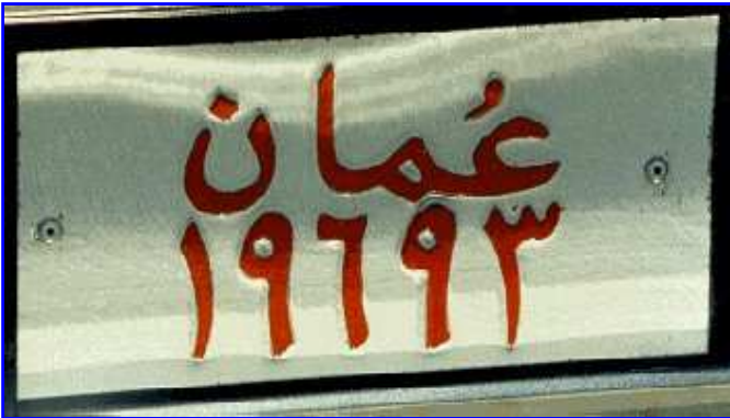
19693 : Government vehicle

Government and ministry vehicles have white plates with, in red, a serial number under "Oman", all in Arabic script.