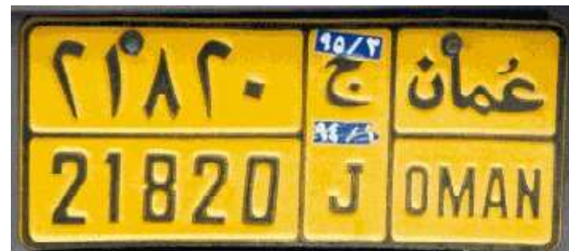
21820 : Pass plate from Junabiah (exp. 02/95)