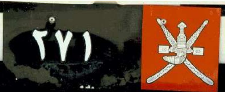
271 : Army

Military vehicles have black plates with a white Arabic serial number; this is prefixed or suffixed by a colored panel bearing a crossed swords device : White on Red : Army - White on Light blue : Air Force - White on Dark blue : Navy - Red on White : unknown (this plate also bears a small black yellow serial number at the upper right corner of the plate).