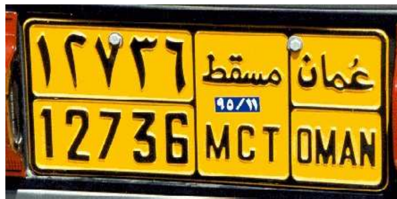
12736 : Pass plate from Musqat (exp. 11/95)

A : Musqat (Musqat) – B : Batinah (Suhar) – D : Dhakhiliya (Nizwa) – DH : Dhahira (Al Buraymi) – J : Junabiah {Dhofar} (Salalah) – M : Musandam (Al Khasab) – MCT : Capital area (Musqat) – SH : Sharqiya (Sur)