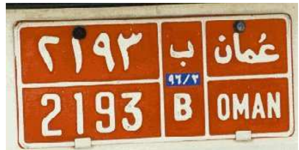
2193 : taxi from Batinah (exp. 02/96)