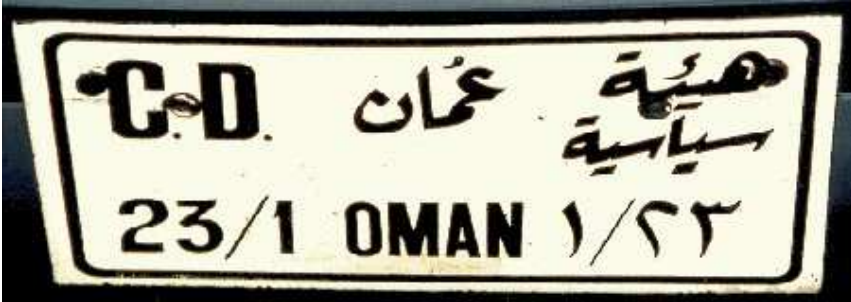
23/1 : Diplomatic vehicle

Diplomatic plates are colored white with black lettering : C.C. or C.D., "Oman" in Arabic, the consular corps or diplomatic corps in Arabic on the upper line, the registration in western characters, OMAN in western script and the registration in Arabic at the bottom. The registration consists of a number denoting the Embassy (details not known), an oblique stroke, and a serial number.