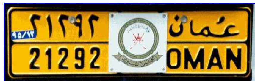
21292 : pass plate owned by members of Majlis Ashura "Consulative Conclil" (exp. 12/95)