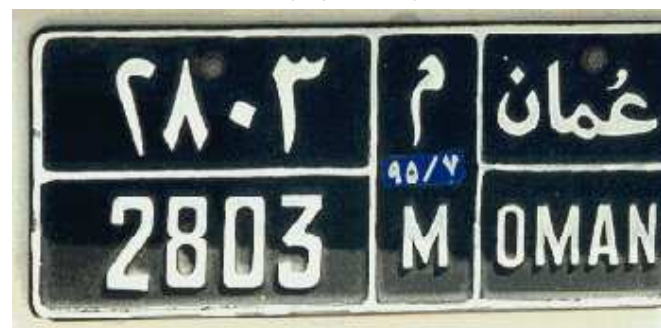
2803 : commercial vehicle from Musandam (exp. 07/95)

From 1986 motorcycle plates have been divided into three, wholly in Arabic script; the district code separated by a vertical line from "Oman" above a serial number. Privately owned motorcycles have black on yellow plates but it is not known if any other colors are used.