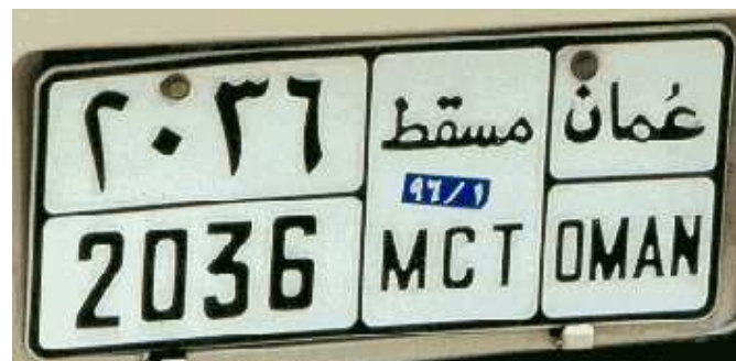
2036 : self-drive rental from Musqat (exp. 01/96)