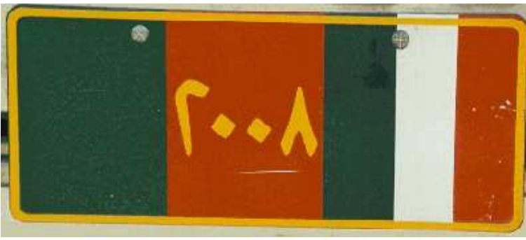
2008 : Diwan of the Royal Court

Government and military officials have plates with green, red and a third vertical bands, with a yellow Arabic serial number and a yellow border. The third band is bearing a special device : Three vertical bands of green, white and red colors : Type unknown - Yellow on white with two numbers in a circle : Type unknown - White with a red crescent and crossed swords : Ambulance - White with a green palm tree : Type unknown - Golden anchor on dark blue on white : Navy.