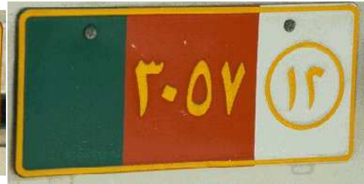
3057 : Diwan of the Royal Court